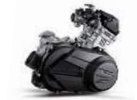
500 HO 4-VALVE, SOHC, EFI 38 HP, liquid cooled, single cylinder, 4-valve featuring Bosch® Electronic Fuel Injection and CVTech clutching.