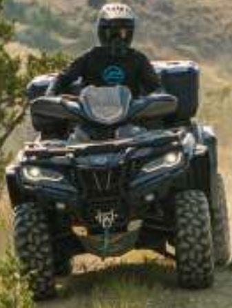
CFORCE® 1000 OVERLAND

963cc V-twin cylinder EFI engine, heavy duty steel bumpers and skid plates, beadlock rims, 3 removable hard-side travel cases, trailing arm rear suspension, 3,000 lb. winch.