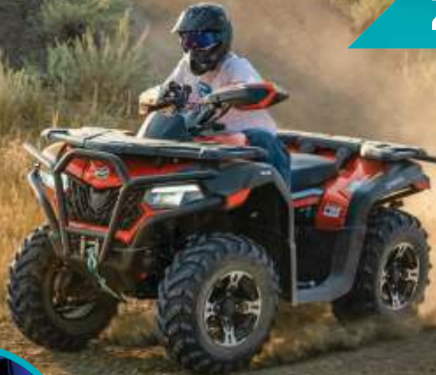
Shown with optional accessories.

Keep an eye on the important stuff. Monitor twelve engine vitals at a glance.