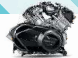
1000 V-TWIN 8-VALVE, SOHC, EFI 79 HP, liquid cooled, twin cylinder, 8-valve featuring Bosch® Electronic Fuel Injection and CVTech clutching.