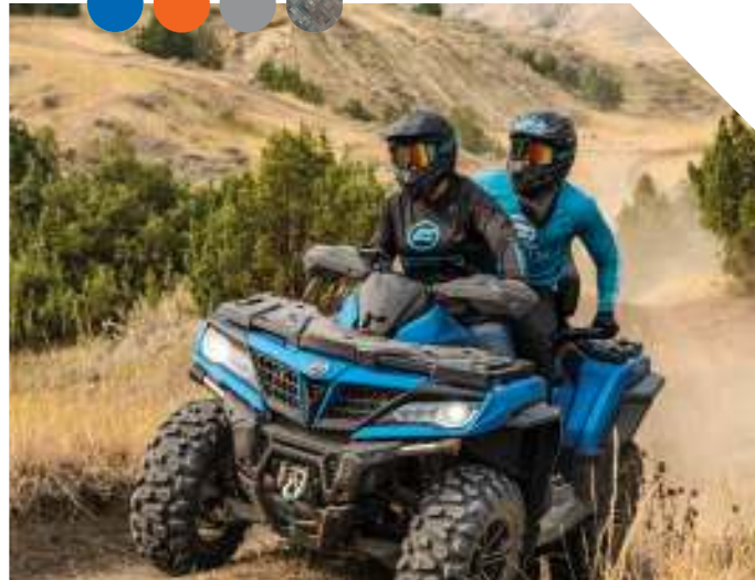
CFORCE® 800 XC

963cc V-twin cylinder EFI engine, heavy duty steel bumpers and skid plates, beadlock rims, 3 removable hard-side travel cases, trailing arm rear suspension, 3,000 lb. winch.