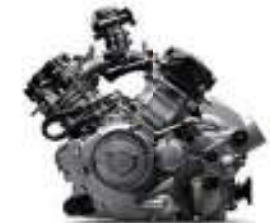
800 V-TWIN 8-VALVE, SOHC, EFI 62 HP, liquid cooled, twin cylinder, 8-valve featuring Delphi® Electronic Fuel Injection and wet clutch with engine braking.