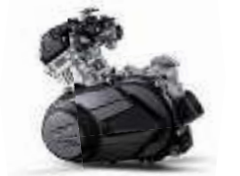
600 HO 4-VALVE, SOHC, EFI 40 HP, liquid cooled, single cylinder, 4-valve featuring Bosch® Electronic Fuel Injection and CVTech clutching.