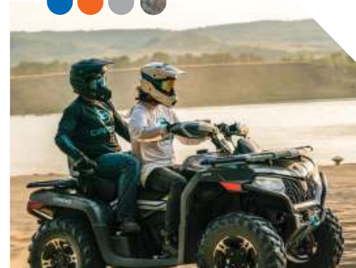
CFORCE® 600 TOURING

800cc V-twin cylinder EFI engine, front and rear composite-over-steel racks, 2-up seating, trailing arm rear suspension, 3,000 lb. winch.